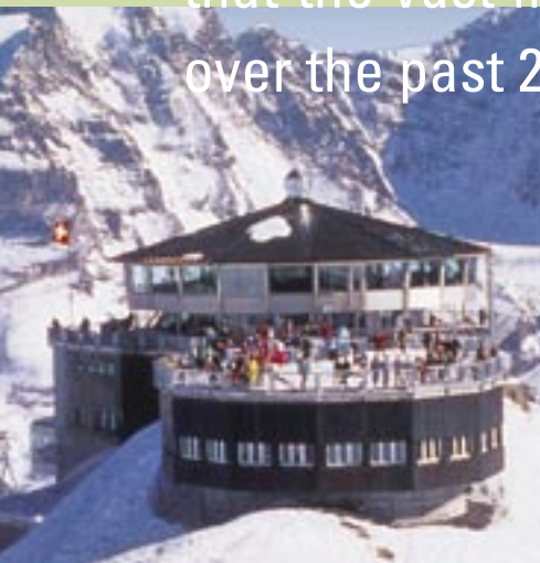
Piz Gloria ski lodge on Schilthorn mountain in the Swiss Alps

Vinyl windows are so durable that the vast majority of them installed over the past 25 years are still in use